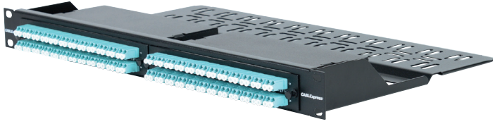
CBX-HE-EAH01 CABLExpress 1U 2 Slot H-Series Easy Access with rear manager